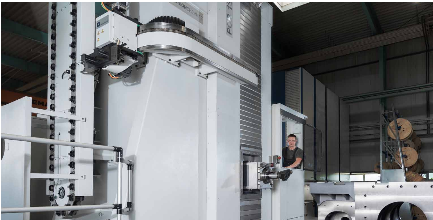
Union PCR 160: Horizontal boring mill with fully hydrostatic guidance system

When revamping HerkulesGroup machines, DMI has a unique advantage – being able to refer to the original drawings. We also maintain original drawings and documents for Voith and Farrel grinders.