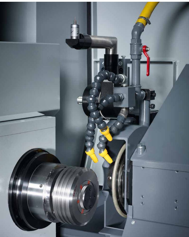
Groove grinding machine HS3

Designed by the engineering departments in Germany, the new machines are built and assembled by the experienced employees of DMI. Horizontal boring mills in Union design as well as lathes and roll grinders by WaldrichSiegen and Herkules have already been built successfully.